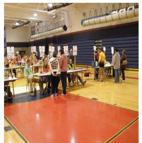
Pennsbury H1N1 flu clinic, November 12th.